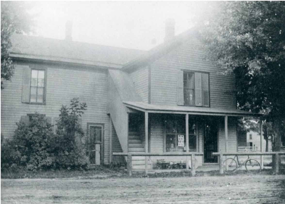
Barnards Variety Store before it was moved