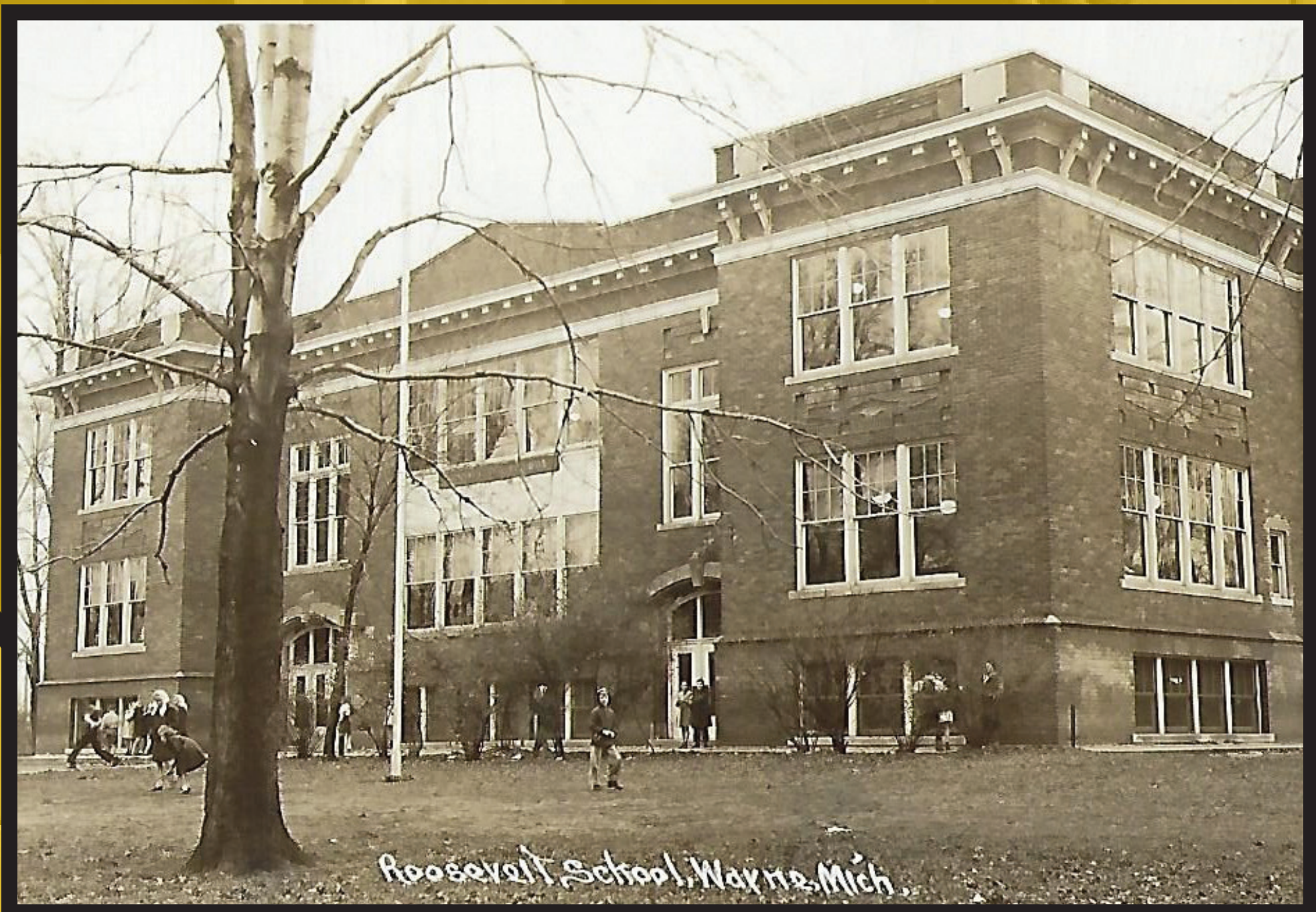
By 1909 the Union School was getting old, so it was demolished and replaced with a new building, the Roosevelt School.