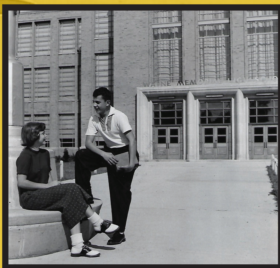
In 1952 Wayne Memorial High School opened, and has been added onto several times to grow with the community.