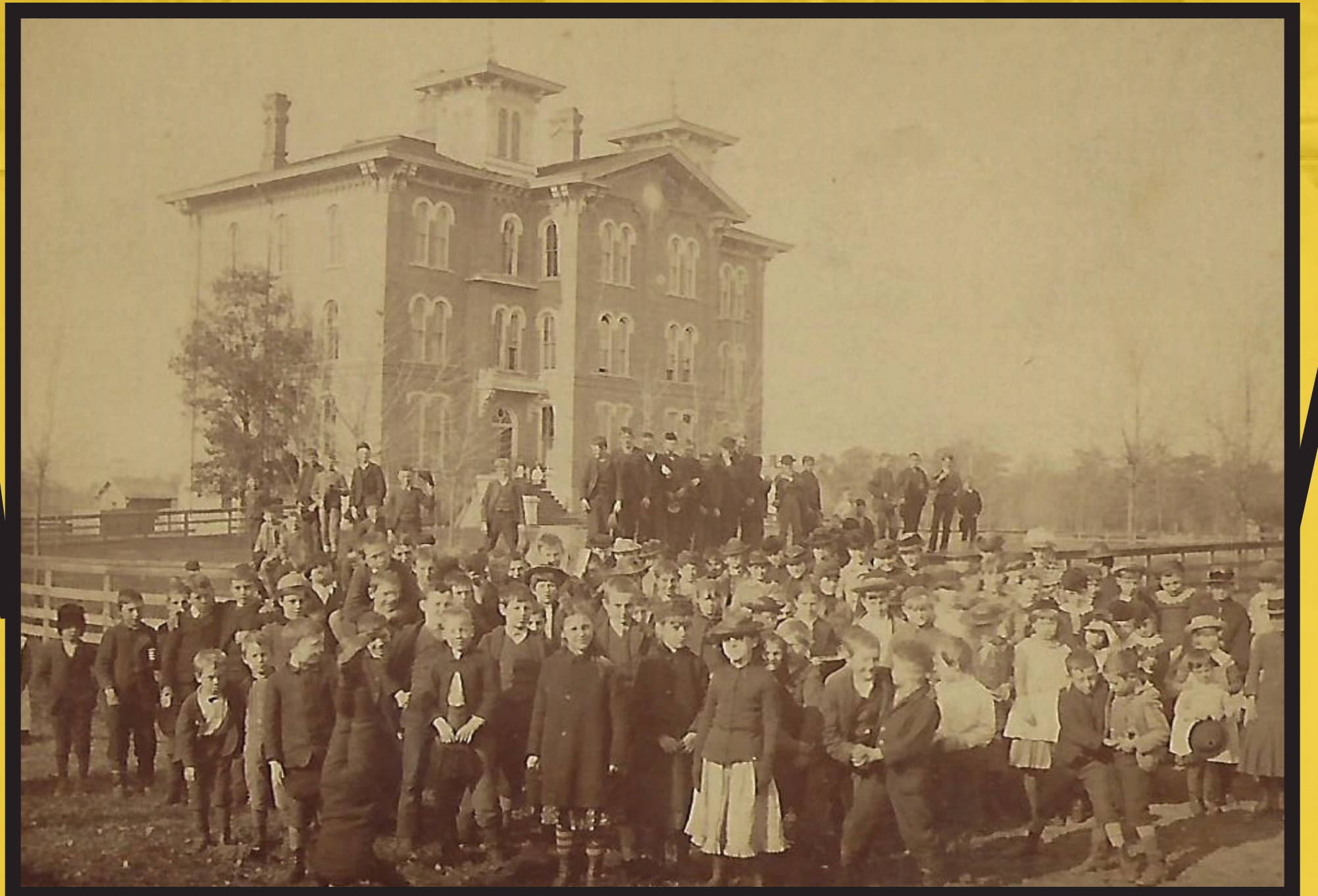
In 1870, $19,000 was spent to build a three-story brick school building named "Union School." It was regarded as one of the finest schools in the area.