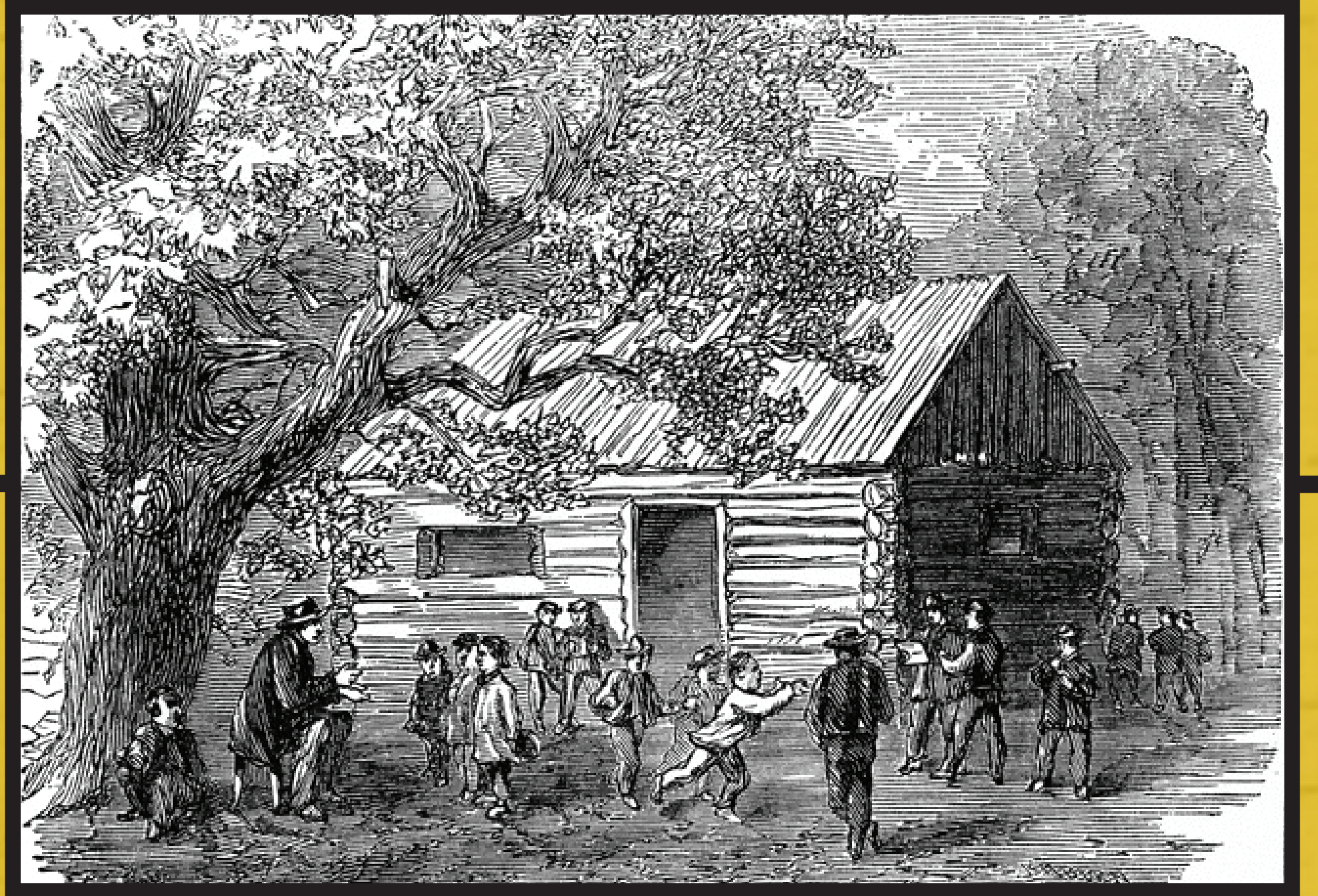
In 1838 a one-room log building was constructed to serve as a school, church, town hall and meeting house. This building would remain the school until 1851.