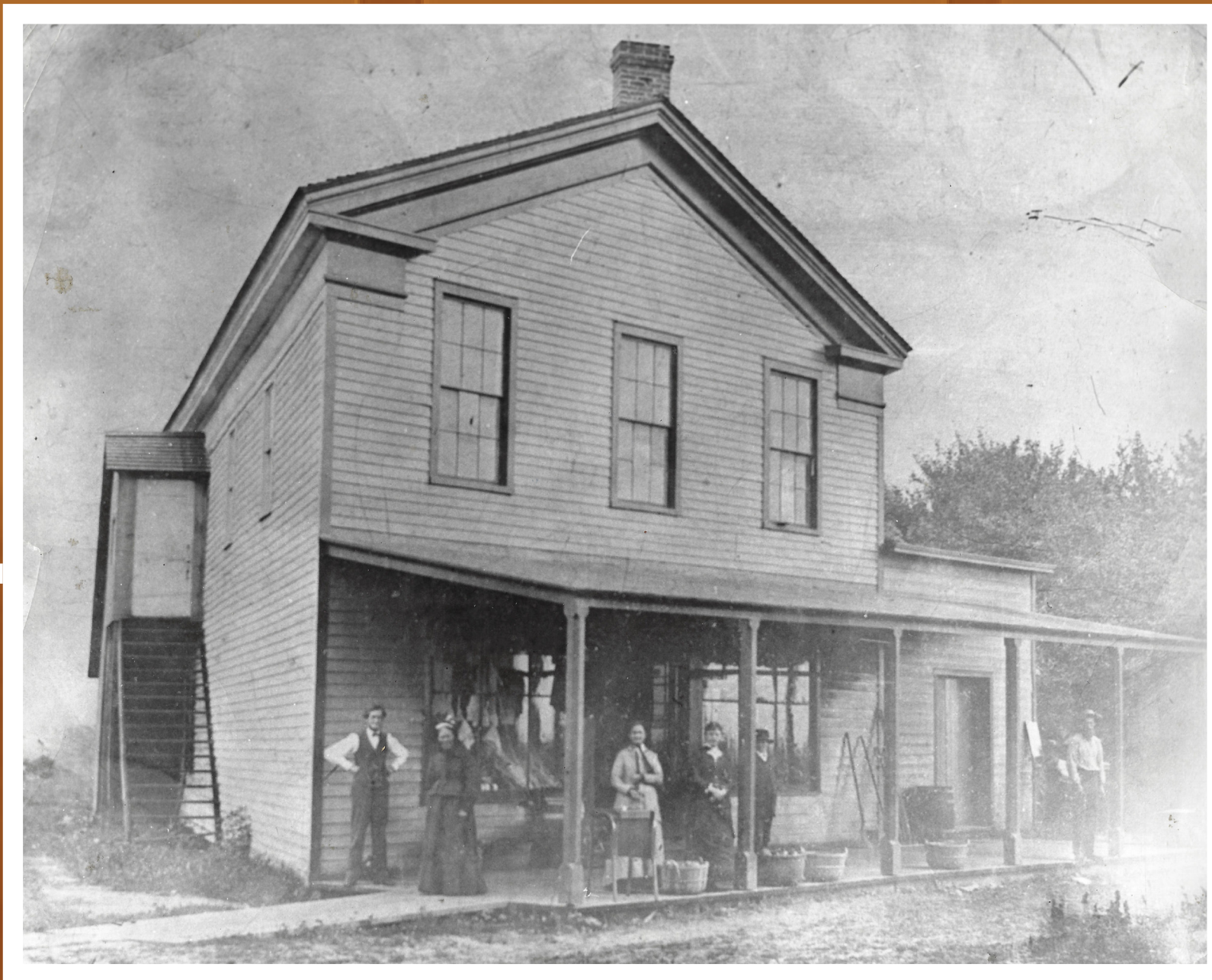
The first general store in Wayne opened in 1847, followed by J.D. Bunting's store in the 1860s. Bunting's store, pictured above, supplied one with anything you needed from coffee to cloth.