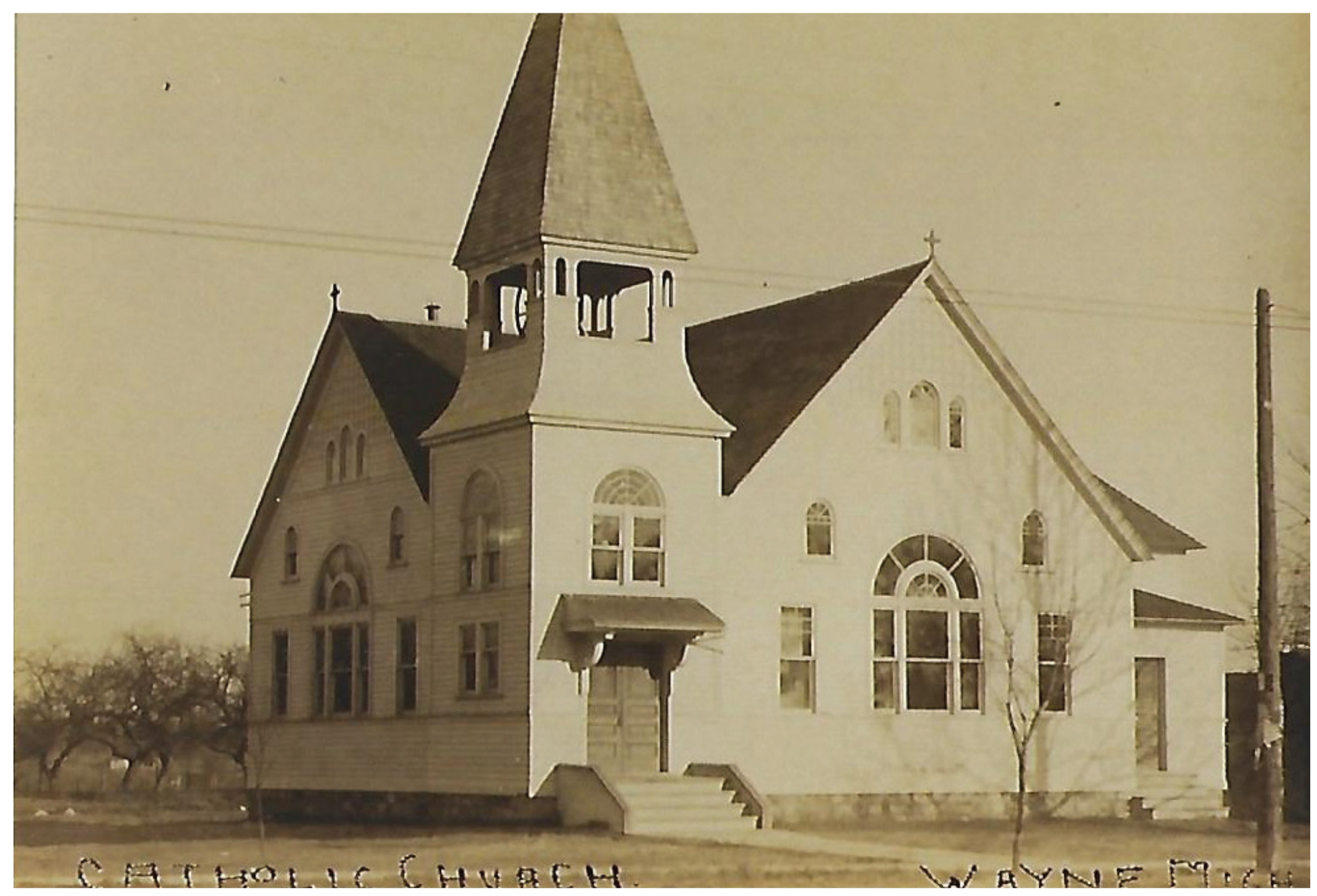
Interest in a parochial school began to develop in the 1920s among the growing St. Marys parish. In 1924 a school opened in the old wood church with 125 students and three sisters.