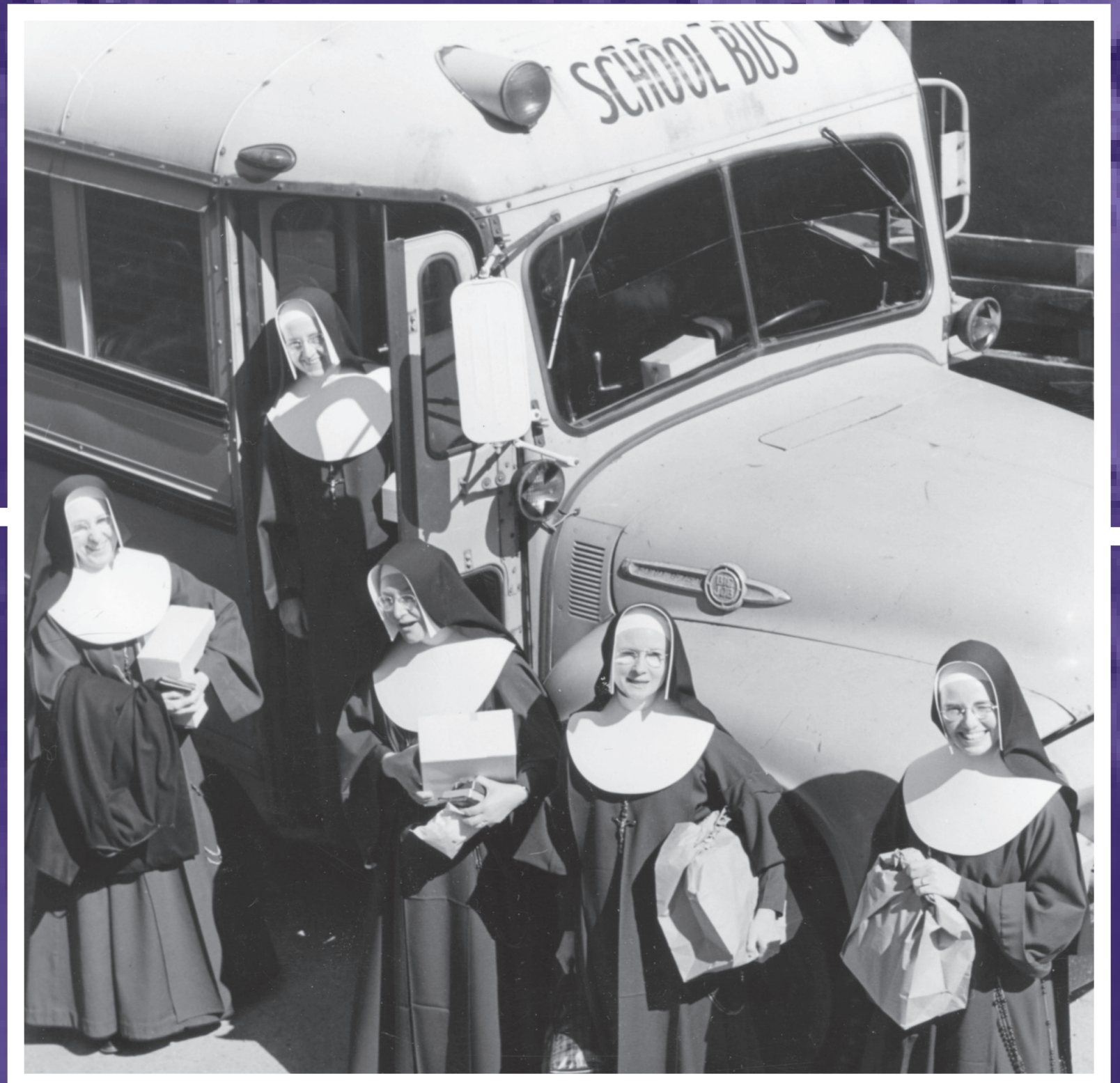
The sisters that taught at St Mary were some of the first to have college degrees, and they were well liked by students and parents.