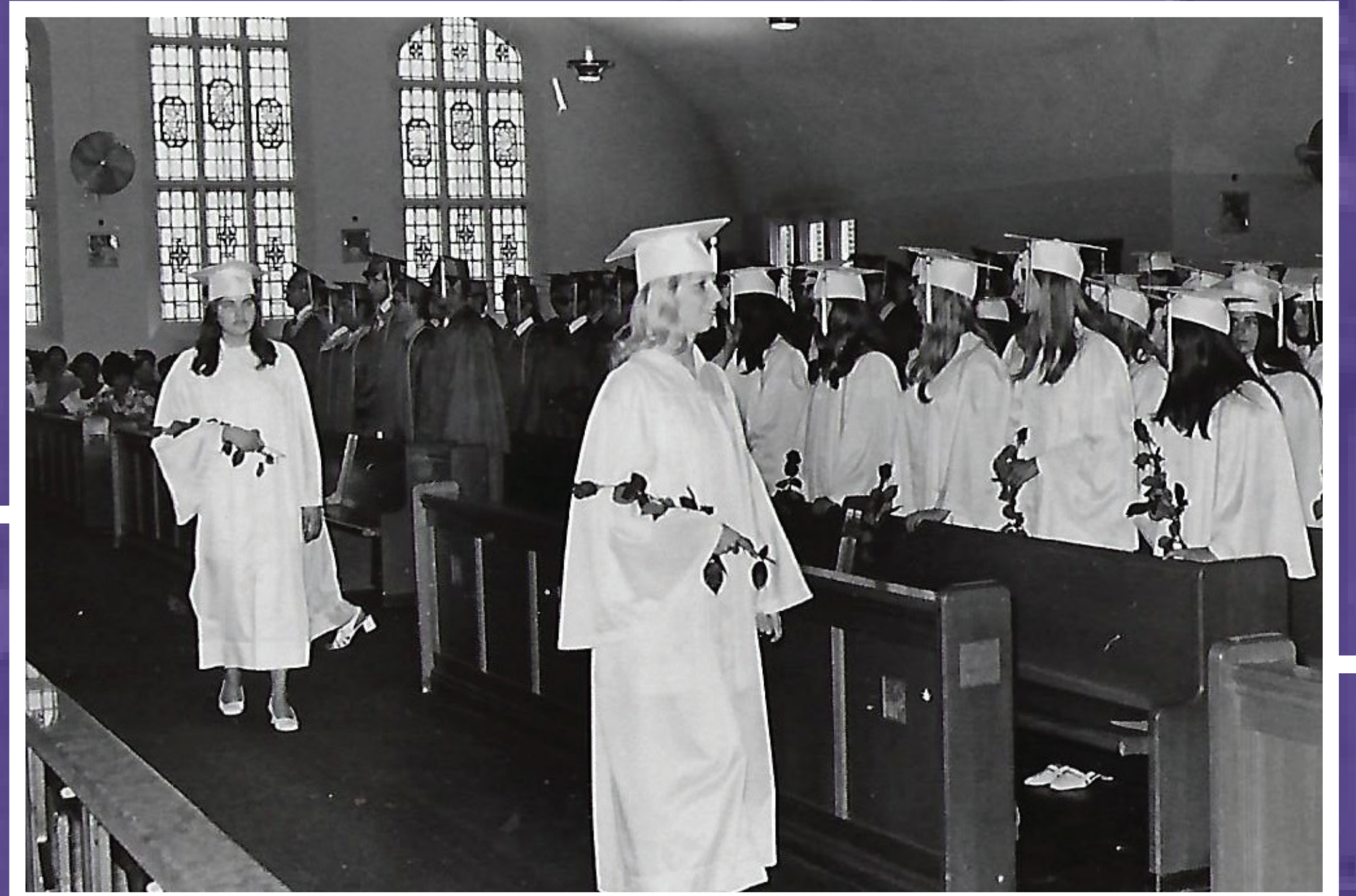
However, behind the scenes debt was mounting, and in 1971 budget problems forced the closure of the high school. This photo is from the final commencement.