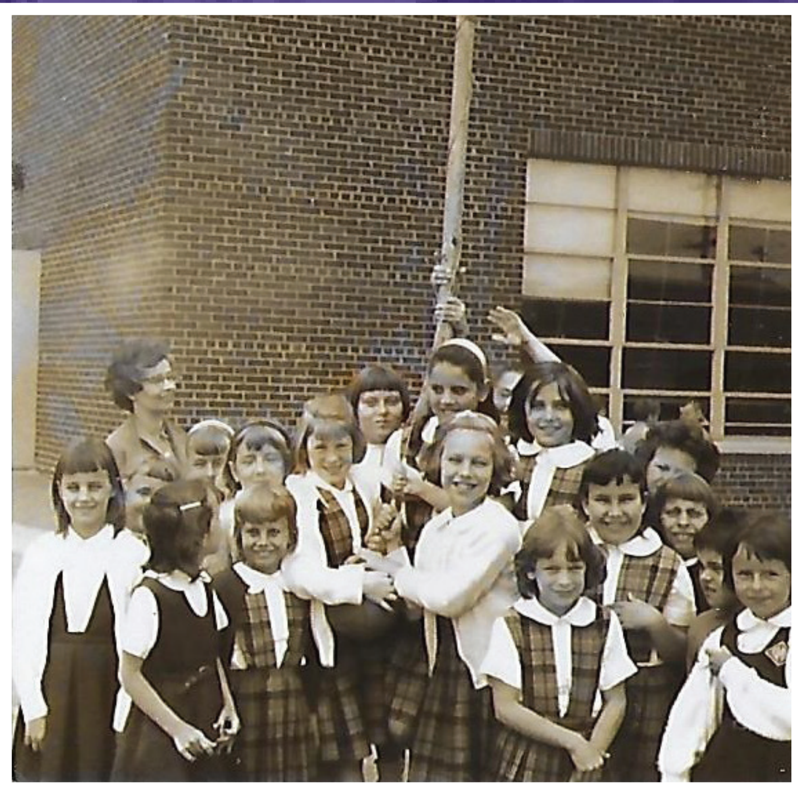
Students were instructed with faith-based curriculum and took the sacraments of reconciliation, first communion, and confirmation by the 8th grade.