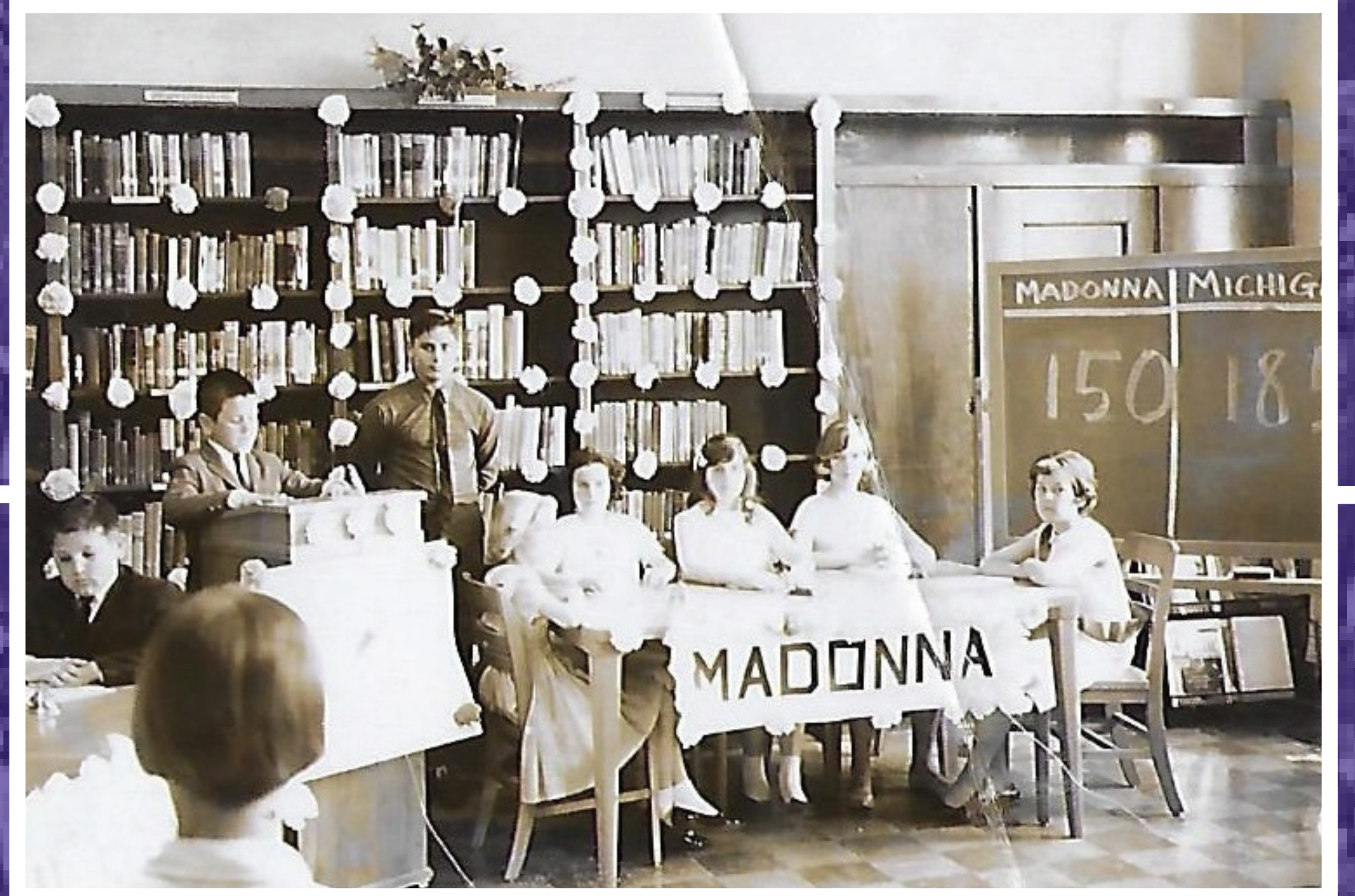
A new building was built in 1929, and the school taught grades 1-8. By the 1940s enrollment had grown to more than 650 students, 12 sisters and 15 teachers.