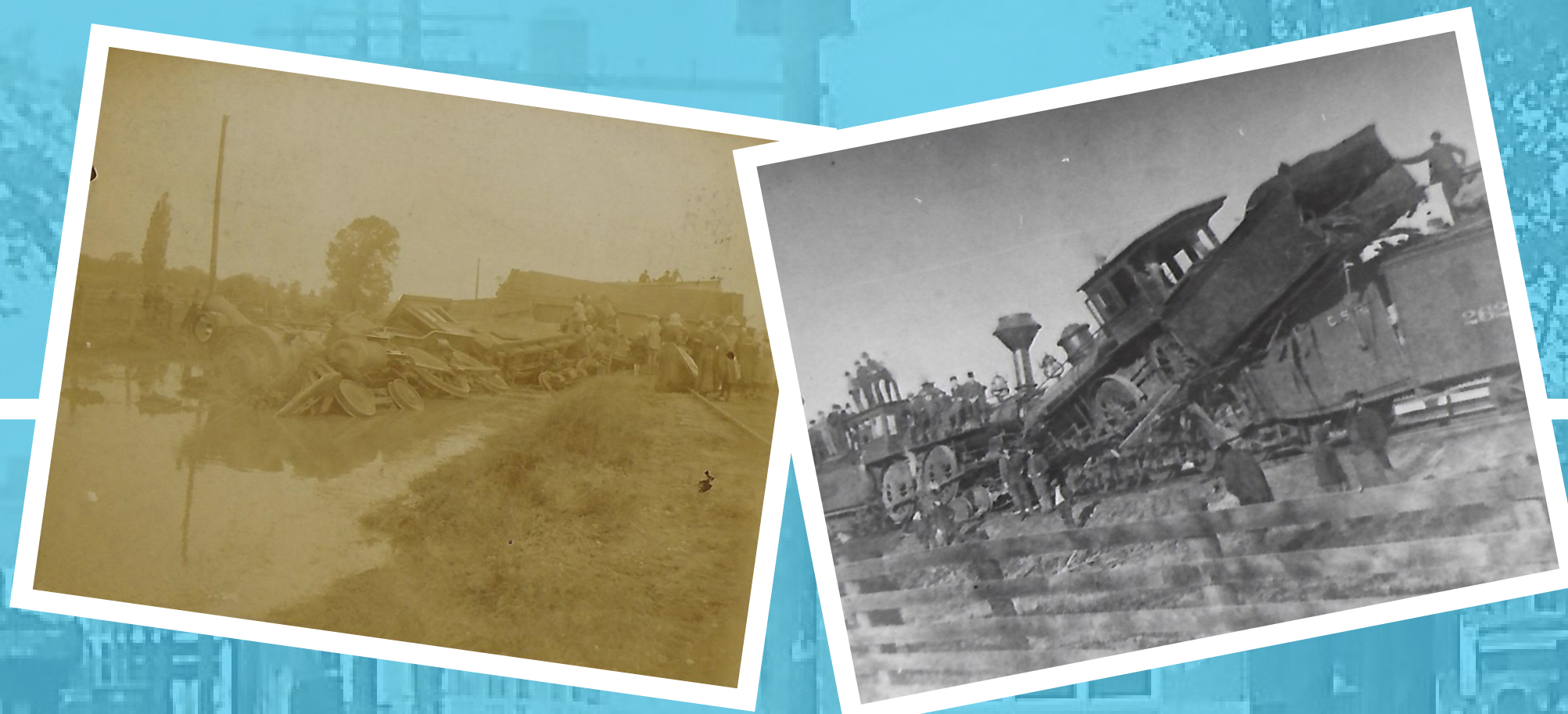
Accidents did Happen...

Over time more and more railroads were built and connected to this line, producing a large rail network across Michigan and the entire country. In 1871 the Holly, Wayne & Monroe railroad was built west of town, heading north and south and formed a junction at Wayne. It later became the Pere Marquette railway.