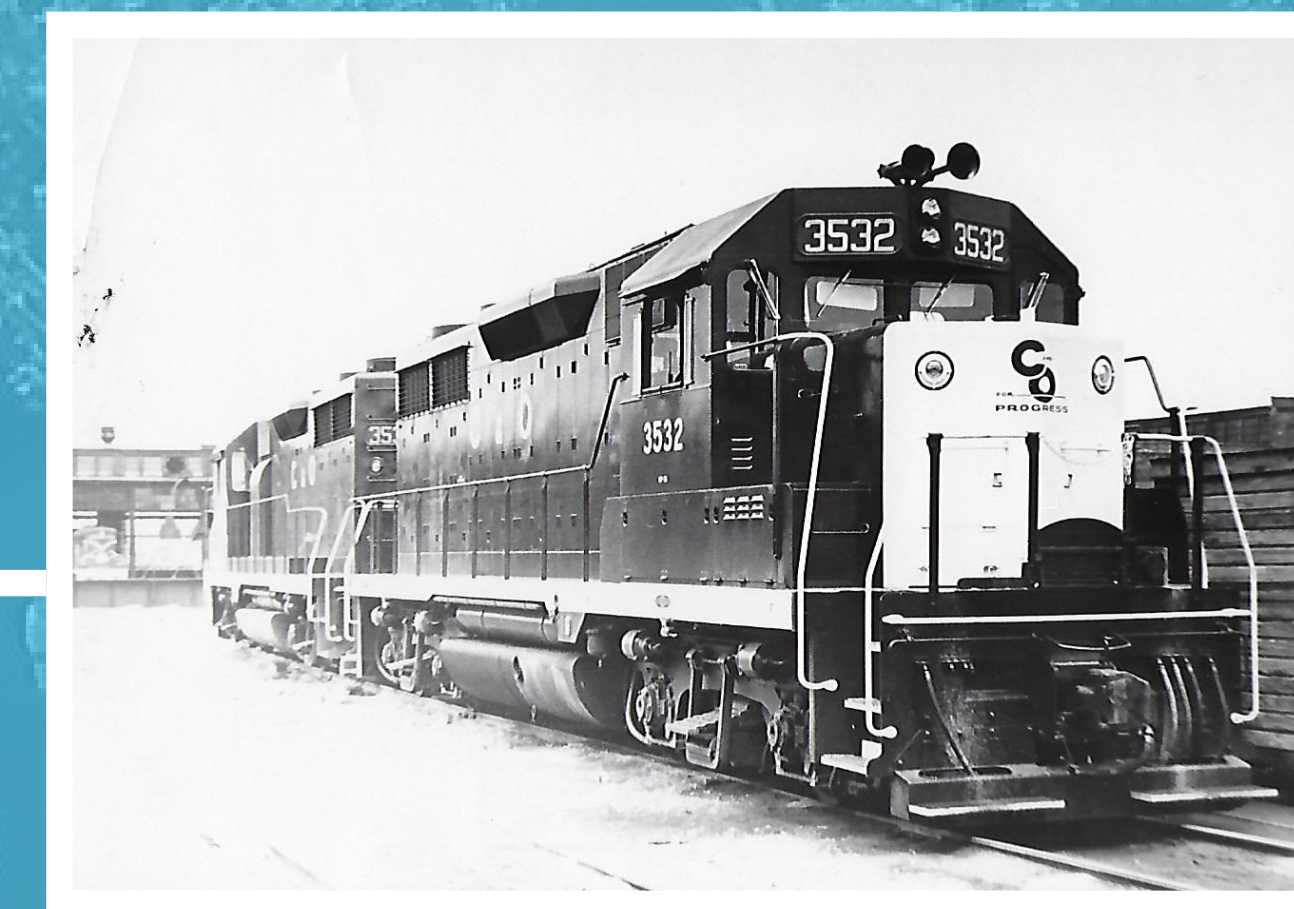
Wayne is still a busy and important railroad intersection today