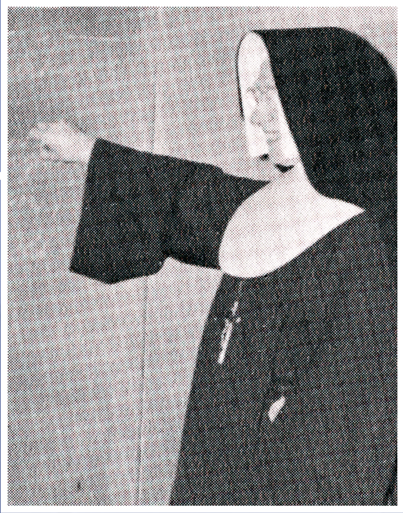
With the creation of the school in 1924 there was a need for teachers, and so that year the first three IHM Sisters arrived in Wayne.