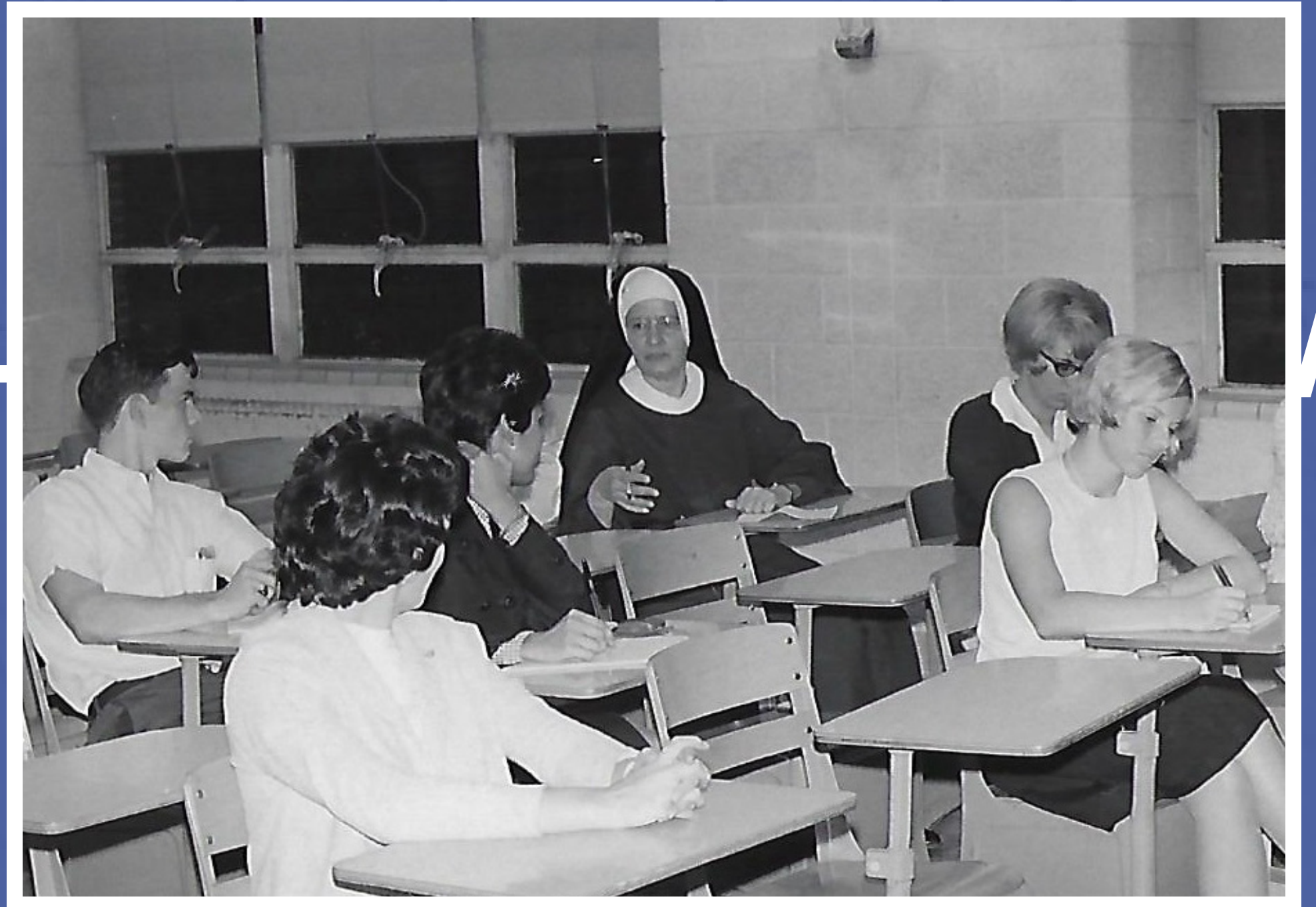
IHM's were highly regarded for their teaching. At the time they taught at more schools than any other religious order in Detroit. They also had teaching degrees years before it was required.