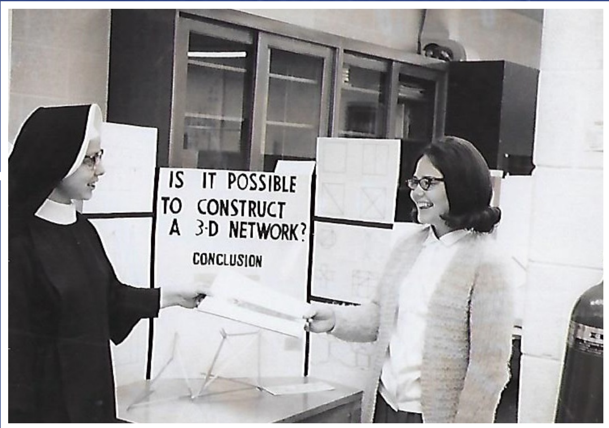
At a peak in 1963, 21 nuns taught over 1,000 students at St. Mary's. The sisters earned a salary of $25.00 per week.