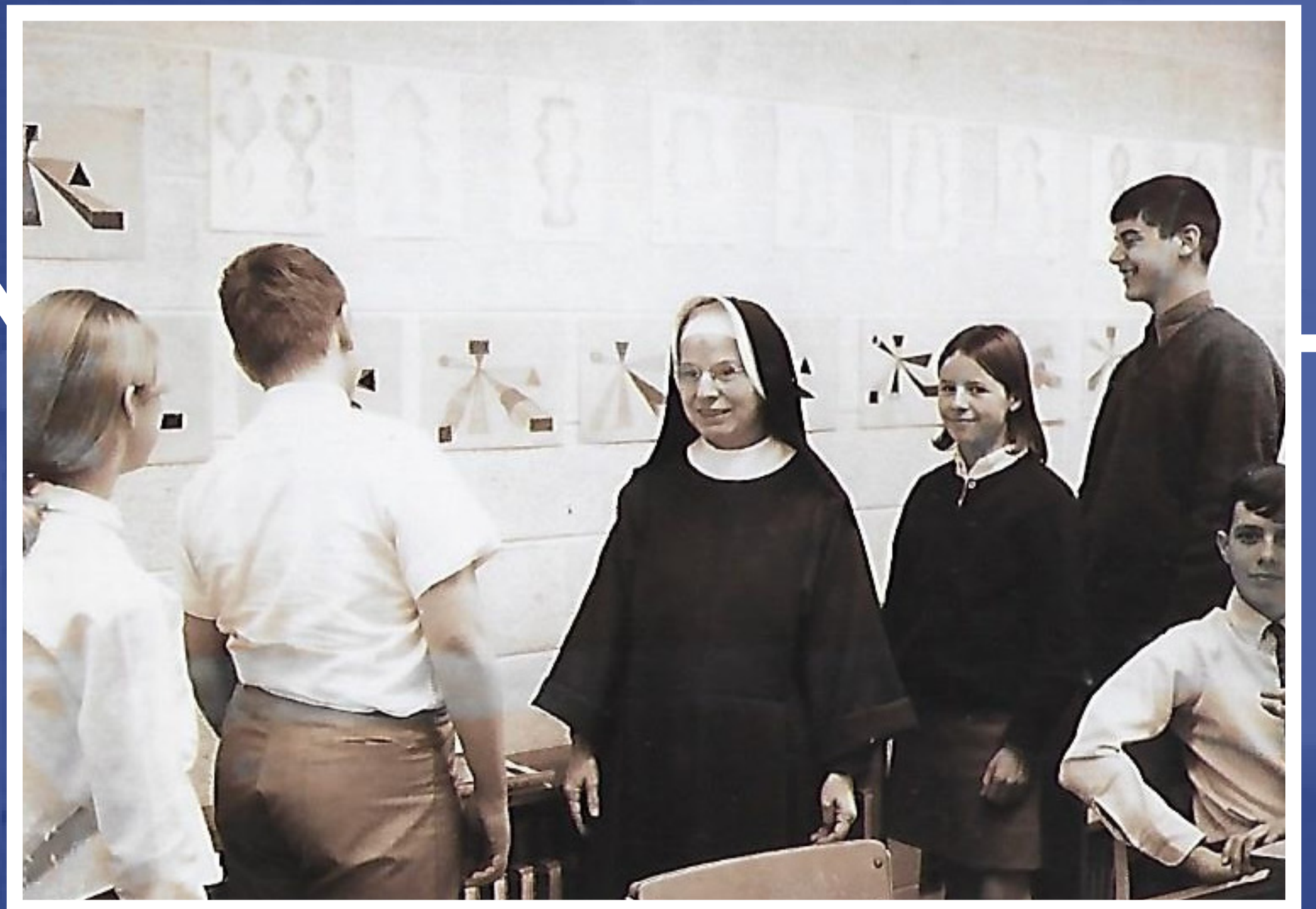
For the most part, students were very fond of the nuns. There was no corporal punishment, and students were known to walk their favorite teachers back to the convent on Main Street.