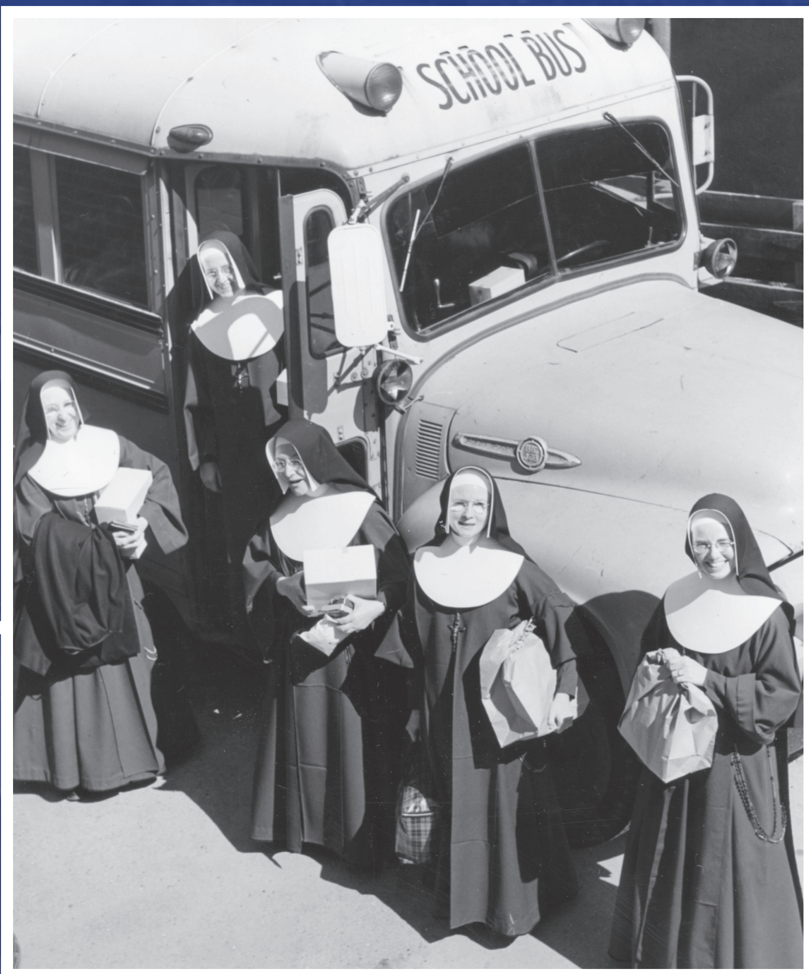
The sisters would leave for the summer and go to the IHM Motherhouse in Monroe. When they returned for the school year they were given gifts and canned goods to stock the convent. They also had one car to share between them.