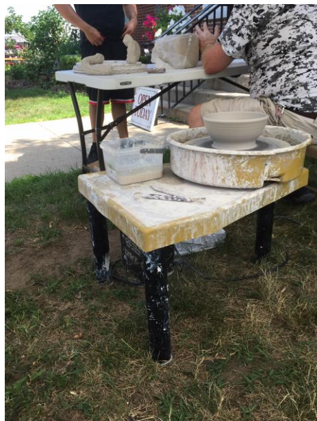
Join us for this fun summer event!

July 10 will be the annual Wayne US12 Car Cruise where thousands of cars old and new descend upon Wayne to show off their cool toys. Come by the museum where we will have a car show, the Dearborn Old Engine Club, kids crafts, historic demonstrations and the star of the show – A Harroun Car made in Wayne in 1919. The owner of the Harroun will be bringing it from Kalamazoo for the day, so don't miss this opportunity! We could also use some volunteer help that day, so if you're interested call the museum or email the society.